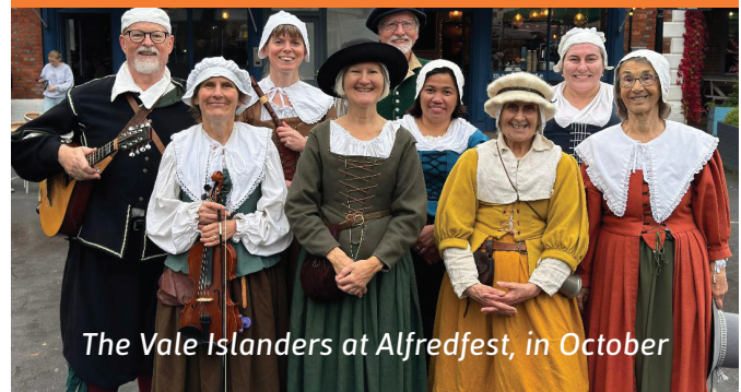
The Vale Islanders at Alfredfest, in October