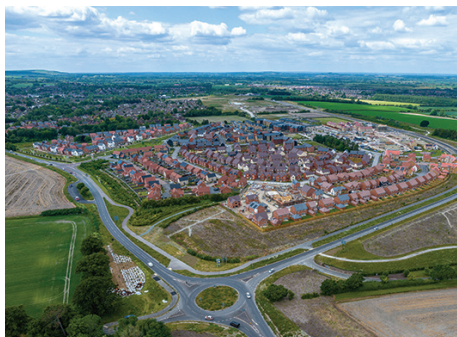
Looking towards Kingsgrove Estate

More details: weir3project@oxfordshire.gov.uk