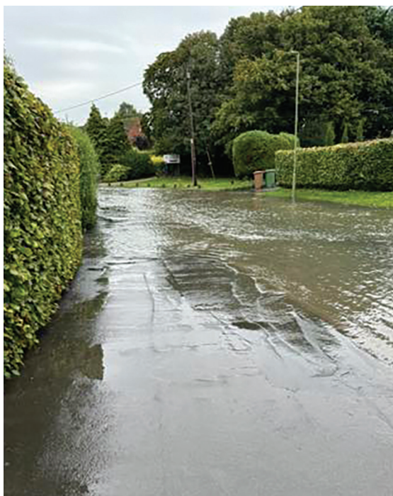
Extensive flooding in Charlton Village

www.oxfordshire.gov.uk and www.oxfordshirefloodtoolkit.com/ for flooding help and advice.