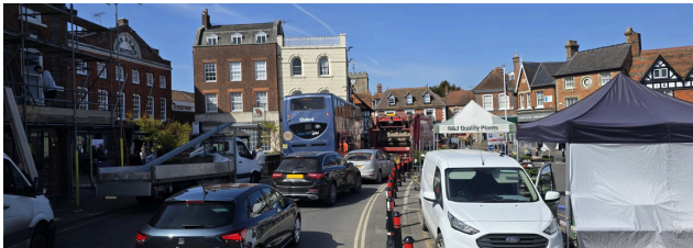
Wantage Market Place suffers with daily congestion of vehicles passing through and not stopping.

Our vision for Wantage Market Place is to create a vibrant, welcoming, and accessible space for everyone.