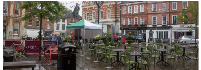
Romsey, Hampshire, a historic market town near Southampton that was regenerated in 2019.