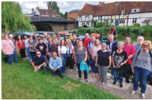
Hosts and Seesen friends enjoying a day out on the Kennet and Avon Canal