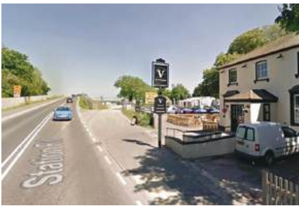
The Volunteer Inn near to the site of the proposed station