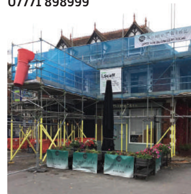
Building in progress at the west end of the Market Place