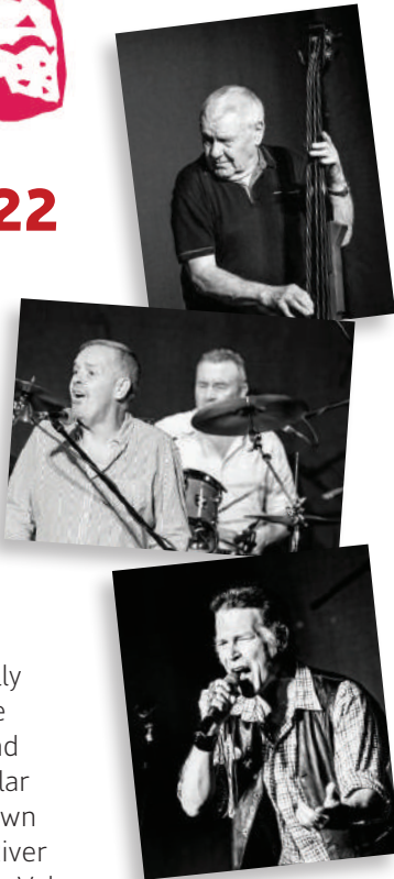
A-Watts (top two) and Thunderbird (above) performing at the Festival Rock Party

Local groups or individuals that would like to participate in next year's Festival should contact jim@wantagesummerartsfestival.com